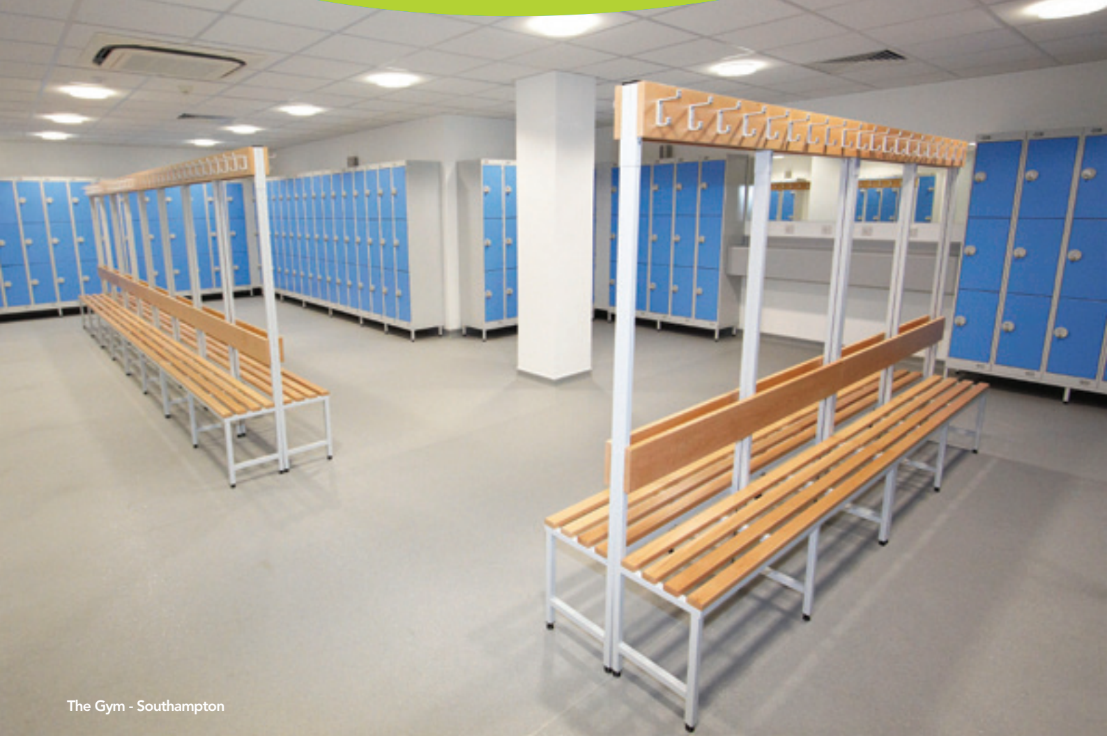
The Gym - Southampton