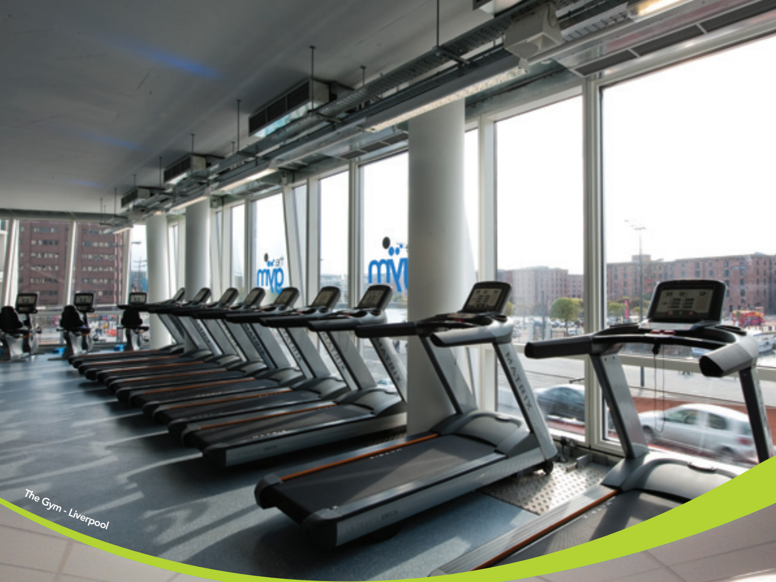
The Gym - Liverpool